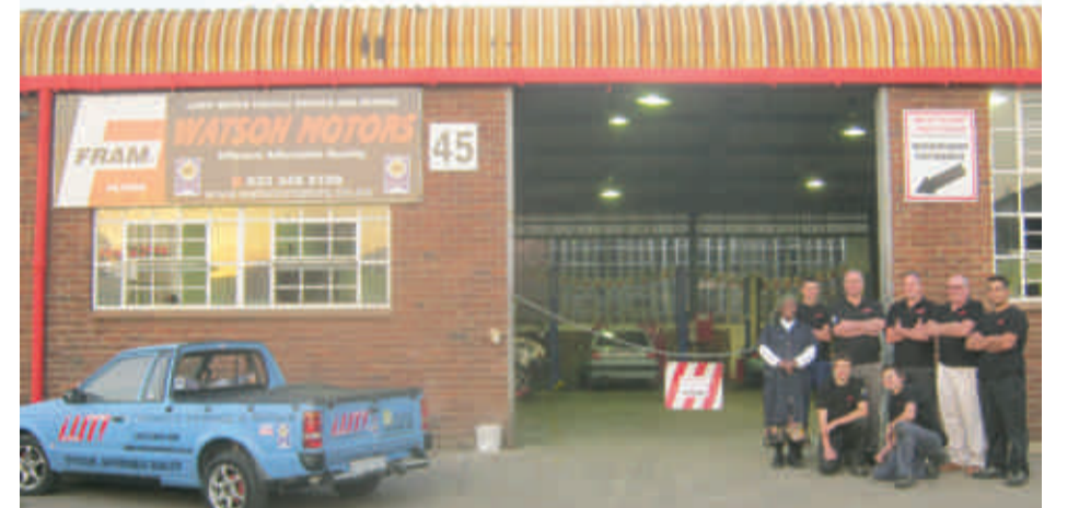
Watson Motors at 45 Clough Street, Pietermaritzburg, offers COR assessments and general repairs and maintenance to all makes of light motor vehicles.